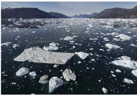
Different size icebergs drift as they melt due to warming temperatures along the Scoresby Sound fjord in eastern Greenland.

Fact Check. The claim that Arctic melting vs. anything else affecting the Earth's rotational speed is unverified guesswork. There might be something to this claim if someone predicted changes about the Earth's rotational speed based on polar ice and then verified them. That would be a scientific process. But that this not the case in the new study. Moreover, there is no scientific evidence that emissions have anything to do with polar ice. The March 2024 annual maximum Arctic sea ice extent, for example, is about the same as 20 years earlier , despite almost a trillion tons of emissions. The Earth's rotational speed has always varied and we don't have an accurate record or understanding of all the factors that caused those changes.