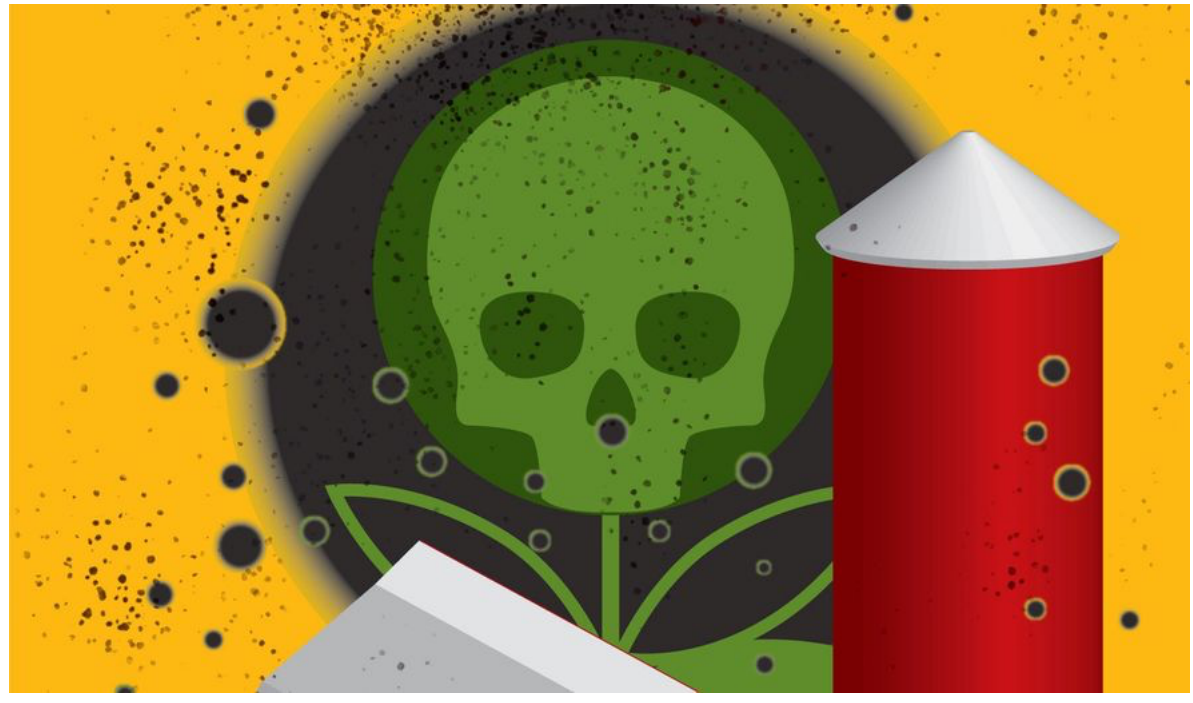
Illustration on Biden's war on farmers by Linas Garsys/The Washington Times more >

Team Biden will reassert that PM2.5 kills hundreds of thousands annually and that there's no safe level of exposure