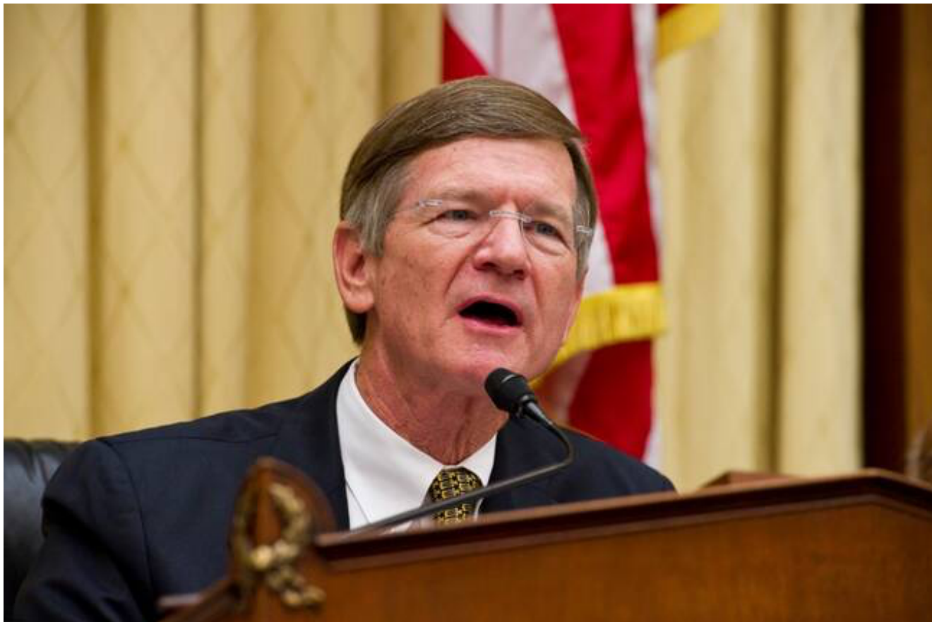
Chairman Lamar Smith, R-Texas, during the House Judiciary oversight hearing with U.S. Attorney General Eric H. Holder Jr. on the Department of Justice.