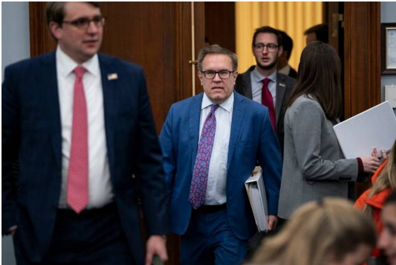
Andrew Wheeler (center), Administrator of the U.S. Environmental Protection Agency, arrives for a House Appropriations Committee hearing in the Rayburn House Office Building on March 4, 2020.