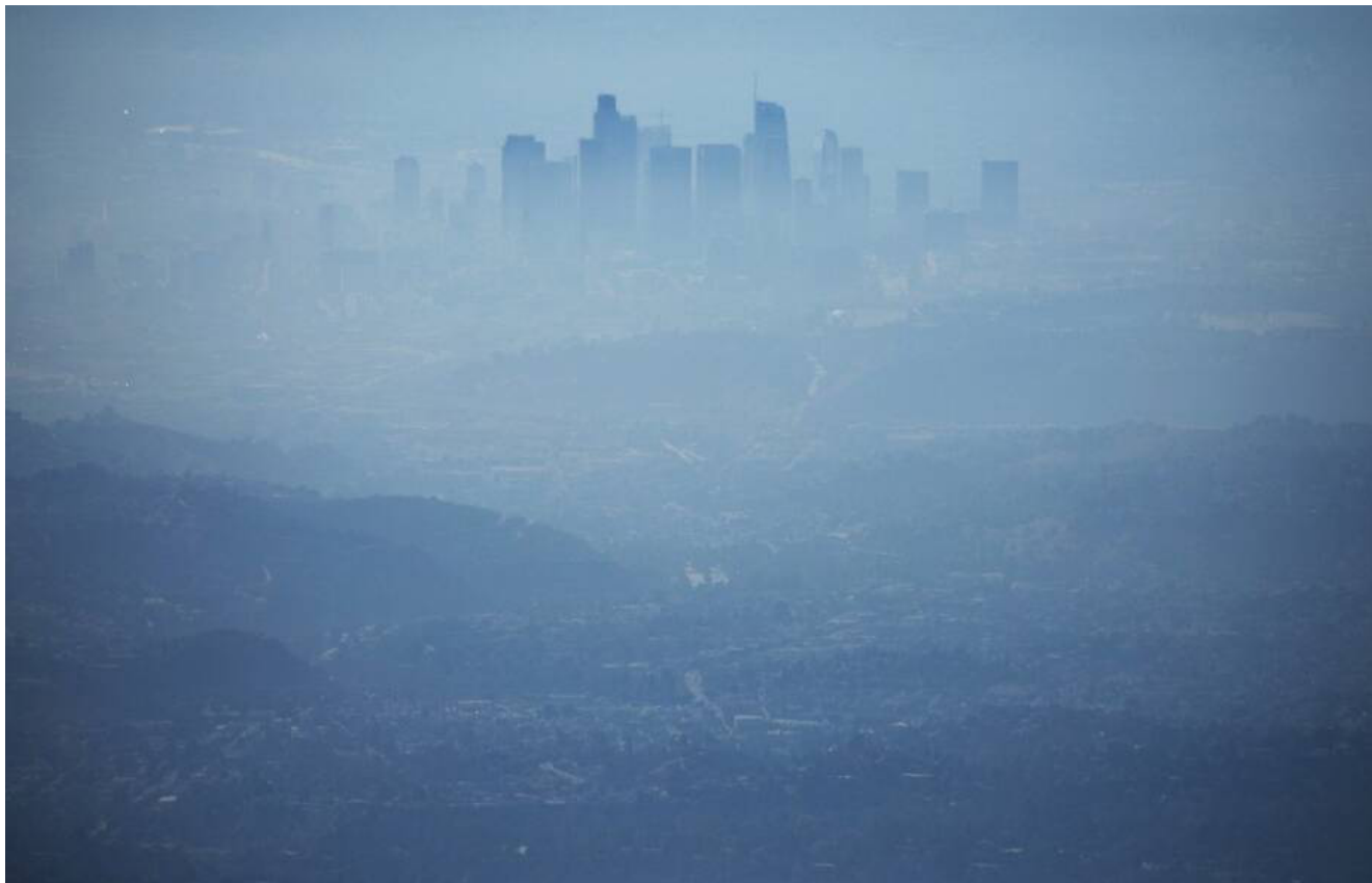
The buildings of downtown Los Angeles are partially obscured by smog at midday on Nov. 5, 2019.

He soon became a one-man exemplar of the wide-ranging and high-stakes conflict over the pollutant. He testified before California state regulators, advised a Congressional committee, and filed a lawsuit over the makeup of EPA's science advisory boards.